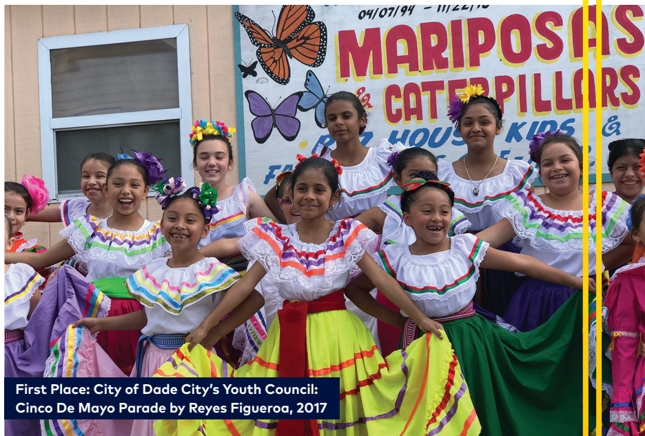
First Place: City of Dade City's Youth Council: Cinco De Mayo Parade by Reyes Figueroa, 2017