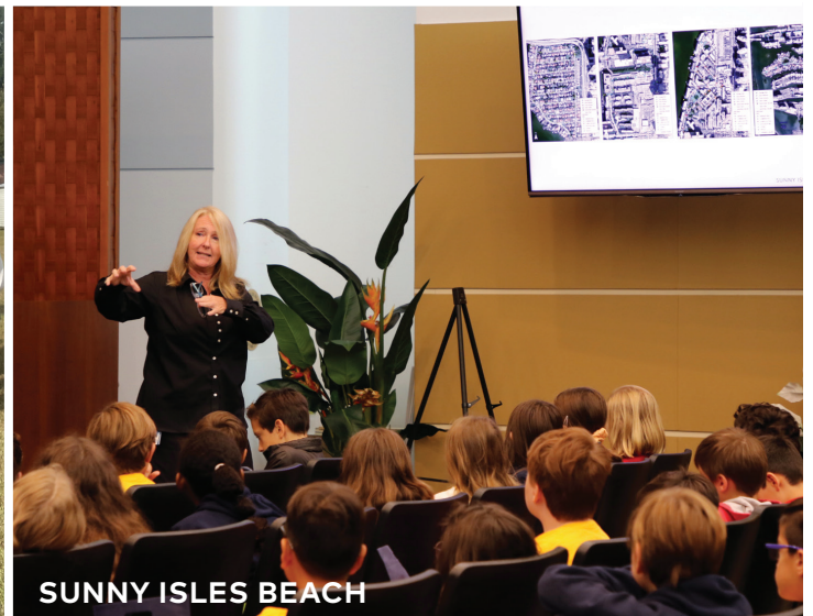
SUNNY ISLES BEACH