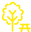
PARKS & RECREATION