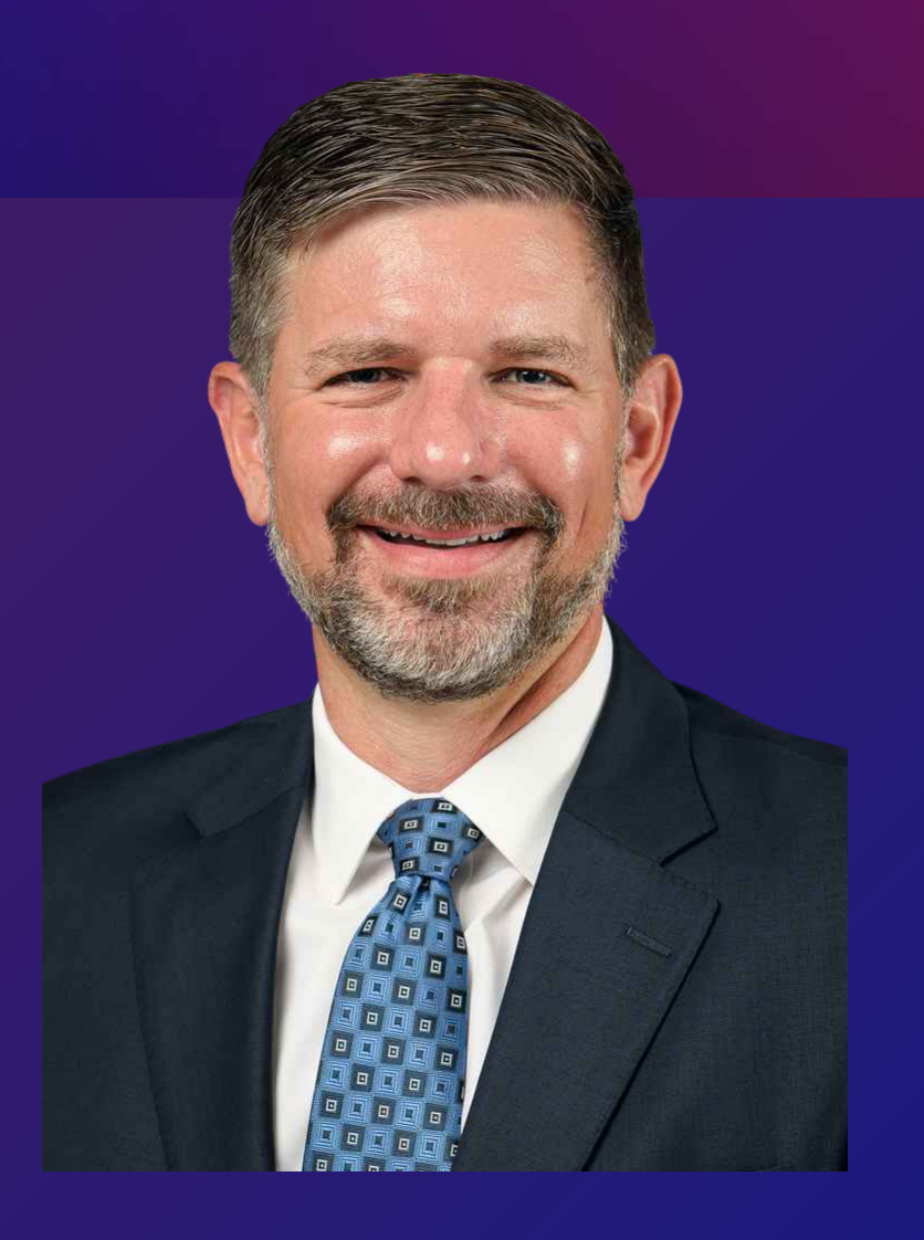
SAM GARRISON House