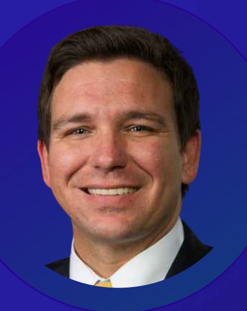
RON DESANTIS Florida Governor